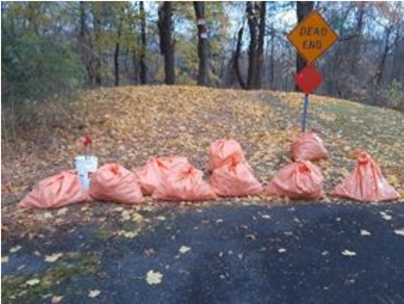
Photos of debris and litter that was cleaned up from a popular party site in a privately-owned wooded area in Slingerlands.